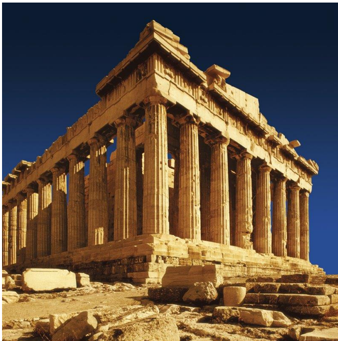
Temple of Artemis at Ephesus

After breakfast at the hotel. Our guide picks us up around 09:00-09:30 am to leave for Ephesus. We will visit the Temple of Artemis , which used to be one of the 7 wonders of the ancient world, the Ancient City of Ephesus , the Temple of Hadrian , the Celcius Library , the Theater , Hamams and the Old Port . Lunch at a local restaurant. Finally, we will visit the House of the Virgin Mary , where Mary spent her last 5 years before she died. Visit to a fur factory. This site is recognized as a place of pilgrimage by the Vatican. End of the tour and transfer to the. Dinner with wine and overnight in Izmir.