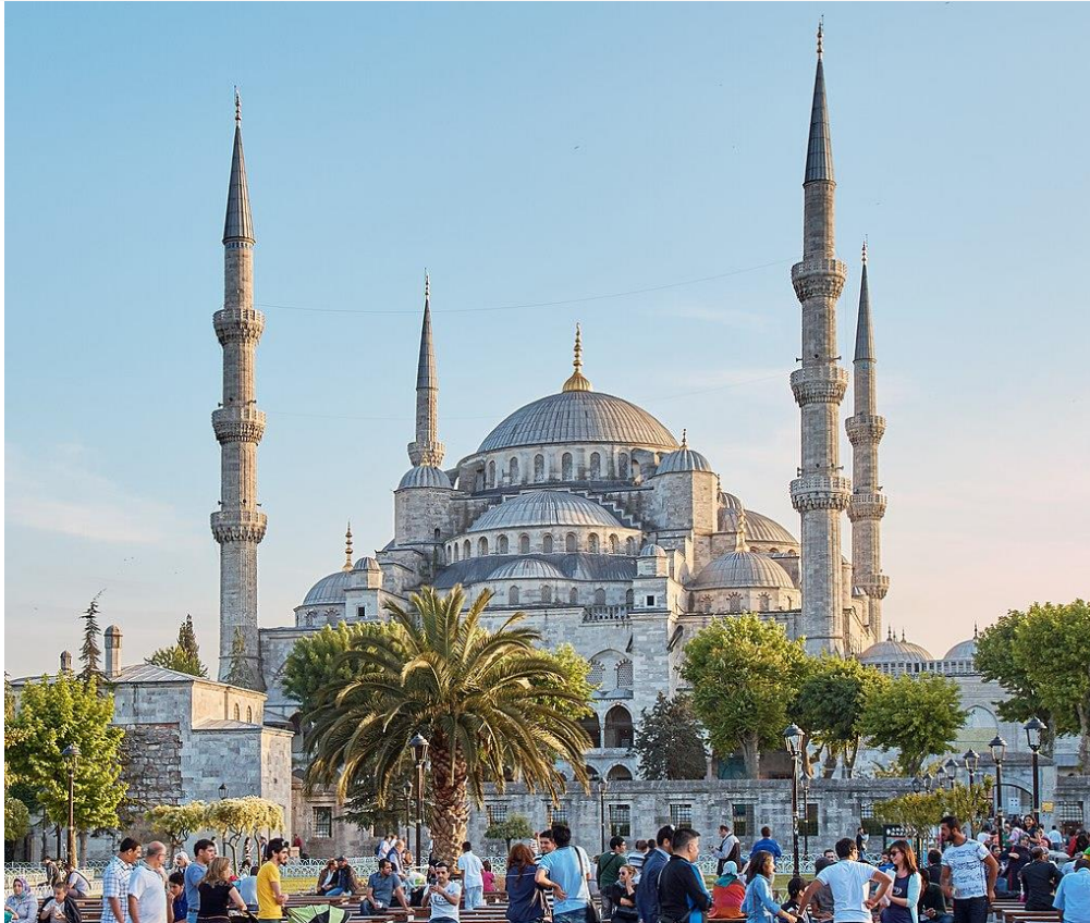
Istanbul- The Blue Mosque

Transatlantic flight to Istanbul, Turkey. Dinner, movies and breakfast on board.